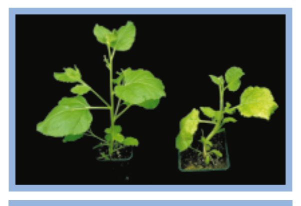
Figure 4 Symptom-bearing and symptomless Nicotiana benthamiana plants inoculated with Can-S.

10-35% of the number of local lesions present on comparable control plants but ELISA values were 65-