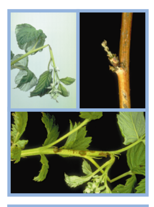
Figure 3 Clay-coloured weevil feeding damage to raspberry plants.

considerably. Single larvae can kill very susceptible plants, whereas large populations may be tolerated on others e.g. clay-coloured weevil larvae appear to cause little root damage to raspberry. The different species may have different larval feeding preferences, e.g. vine weevil larvae tend to feed on roots close to the surface, whilst clay-coloured weevils have been observed feeding on raspberry roots at depths below those reached by conventional pesticide application techniques.