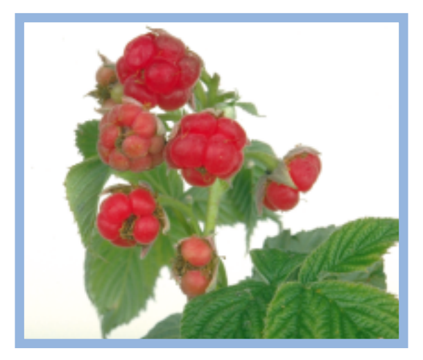
Figure 1 Crumbly fruit in RBDV-infected Autumn Bliss raspberry.

virus is the only means of controlling its spread and effects. Some red raspberry cultivars contain such resistance which is conferred by a single dominant gene, Bu . However, in recent years the presence of RBDV isolates able to overcome such resistance (RB, resistance-breaking isolates) has been identified in raspberry fields in England, including commercial raspberry and blackberry crops. The occurrence of