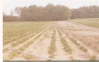
Strawberry red stele in S. Germany

dissemination. Provision of disease-free planting material would provide the ultimate control measure as land remains free of contamination. DNA-based diagnostic methods has enabled the development of rapid and sensitive tools capable of detection very low levels of Phytophthora contamination. SCRI has developed such a method and validation and exploitation in a Scottish disease survey is reported on this poster.