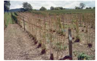
Raspberry root in Scotland.