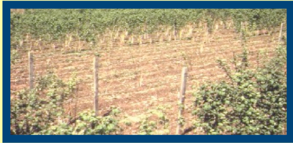
Serious crop loss in a raspberry plantation by raspberry root rot

Root rot resistance caused by Phytophthora fragariae var. rubi continues to be one of the most serious diseases of raspberry.