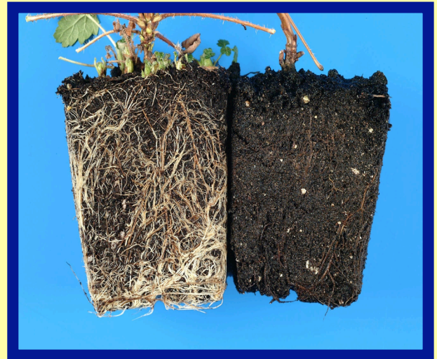
Latham and Glen Moy after inoculation with raspberry root rot

Genetic resistance exists in North American cultivars eg. 'Latham' exhibits field resistance to root rot.