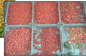
Machine harvested plots are assessed for yield and fruit quality.

The selection of cultivars specifically intended for machine harvesting is a key objective of the breeding programme.