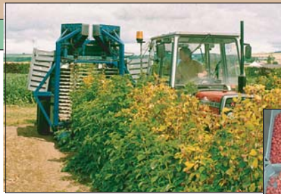
Promising selections are harvested at SCRI using a Korvan machine harvester.)

The selection of cultivars specifically intended for machine harvesting is a key objective of the breeding programme.