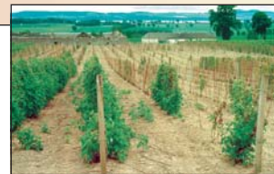
Field plot heavily infested with Phytophthora