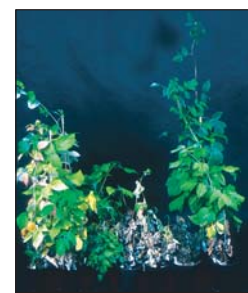
Infected population showing segregation for resistance

Marker assisted selection will be a useful tool in future breeding strategies for Phytophthora resistance since it will identify resistant genotypes quickly relative to current practices. Field infestation plots show results only after several years and glasshouse screening shows no correlation to field results.